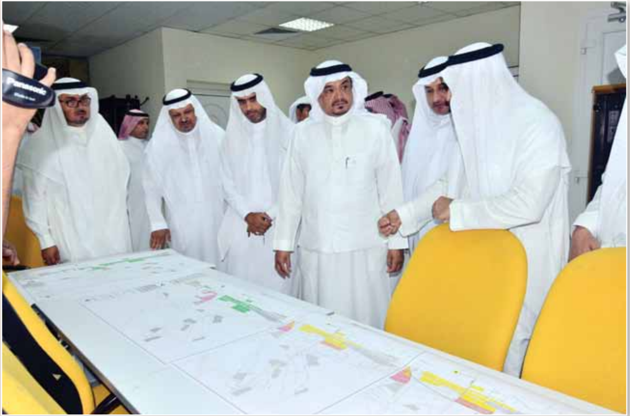
Maps and presentation being explained

The Establishment is keen to improve its performance with modern facilities to serve the pilgrims: