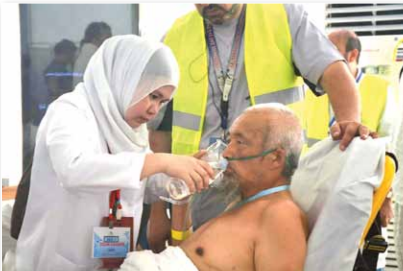
A pilgrim being treated at a medical center