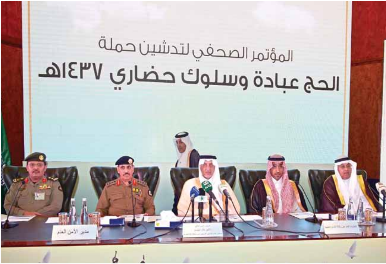
Prince Khalid addresses the officials

was announced in Makkah on Dhul-Qa'dah 13, 1437H. This project, presented to the Royal Court and agreed to after intense study, will be implemented by the Makkah Regional Improvement Council alongside the new civil planning slated for the city of Makkah.