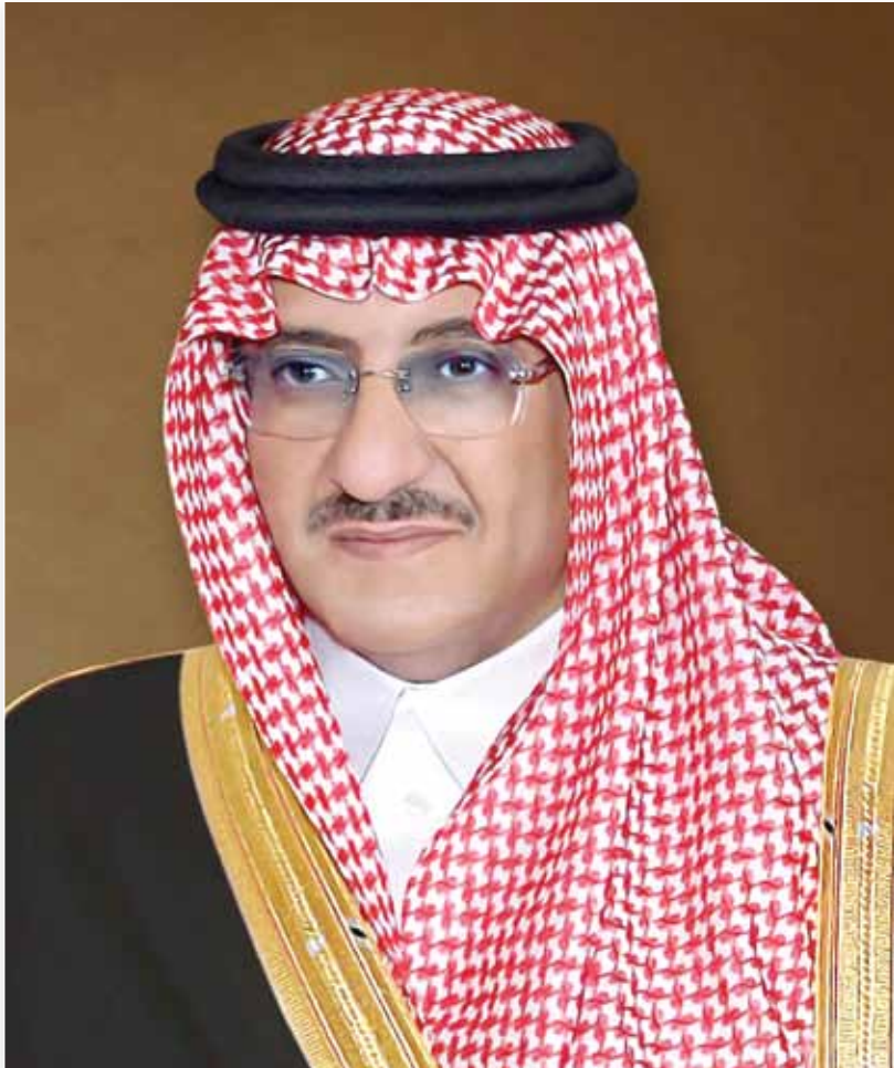
Crown Prince Mohammad Bin Nayef