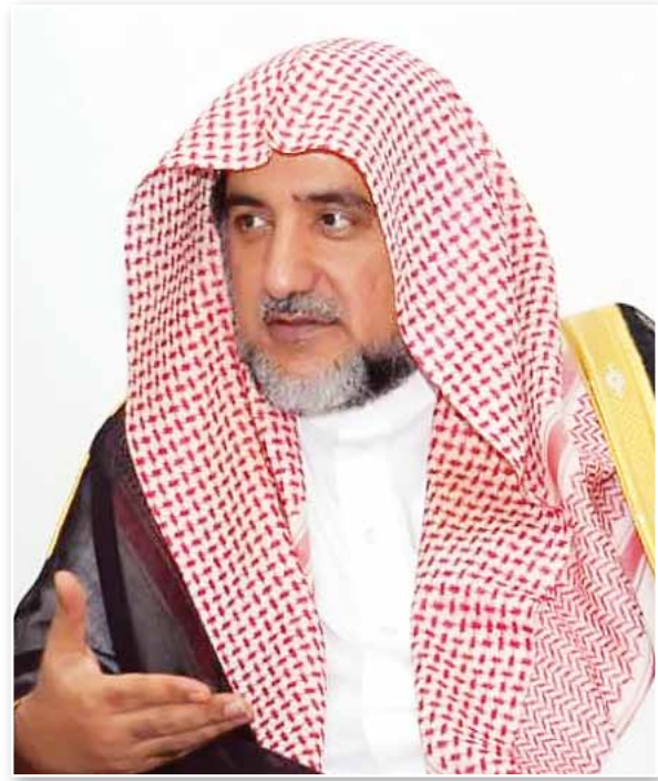
Sheikh Saleh Al-Sheikh, Minister of Islamic Affairs, Call and Guidance