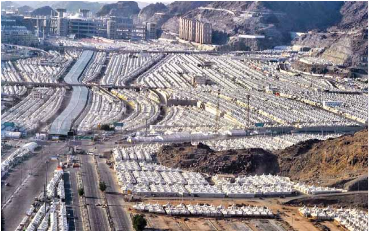
Tents for pilgrims (above) and alert security officials (below)