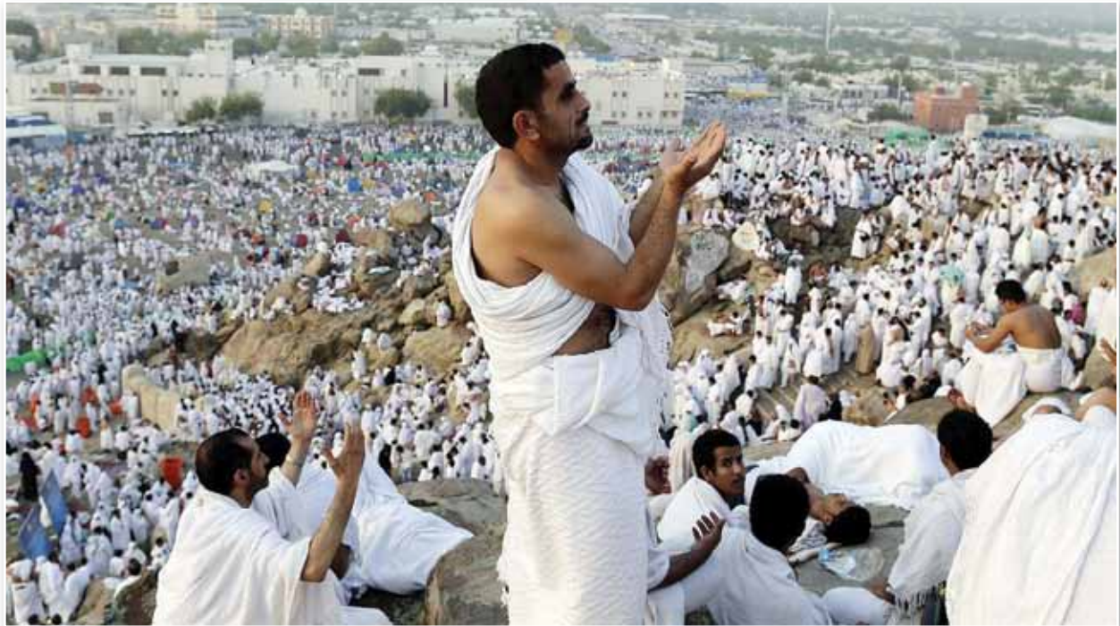
Here I am Oh Allah (above) and a ready fire-fighting fleet

AH), the Justice Ministry announced preparation of 18 specialized judicial districts to look into issues related to Hajj and Umrah pilgrims that arise within the confines of Makkah, Mina, and Arafat. It will supervise agreements for sacrifice, protect the belongings of deceased pilgrims during current Hajj season, and look into other pertinent issues. The ministry has designated judicial departments established throughout the sacred valley and has equipped them with administrative staff.