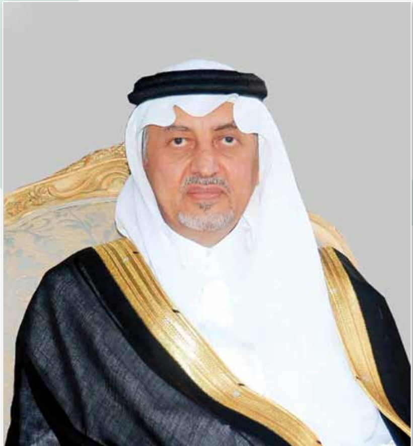
Prince Khalid, Governor of Makkah

Meanwhile, His Royal Highness Prince Mohammed Bin Nayef Bin Abdul Aziz, Crown Prince, Deputy Prime Minister, Minister of Interior and Chairman, Supreme Hajj Supreme Committee met Custodian of the Two Holy Mosques in Riyadh along with Prince Khalid Al-Faisal, Governor of Makkah Region, and Advisor to Chairman of the Central Hajj Committee, and Prince Faisal Bin Salman, Governor of Madina Prince Faisal Bin Salman Bin Abdulaziz, who is also the chairman of the Madina Pilgrims City. During the meeting a comprehensive report on Hajj 1436 AH was presented, evaluating the performance of all con-