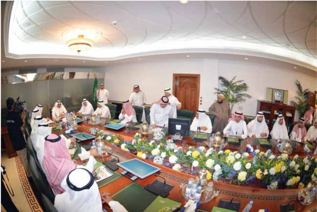
Dr. Benten in discussion with Establishment officials

His Excellency's visit also included a review and tour of all offices and sections of the Establishment accompanied by a brief presentation of the responsibilities that each office and section are tasked with.