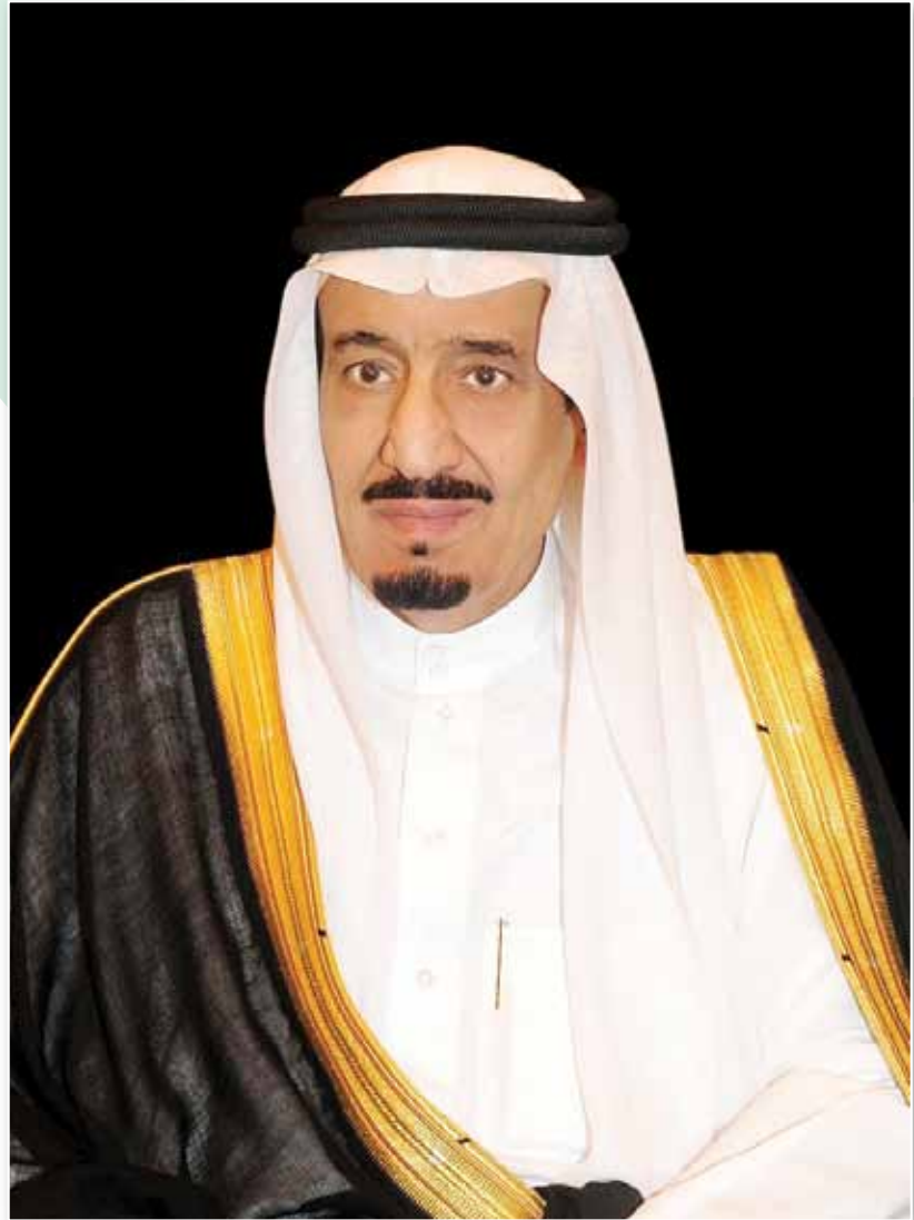
Custodian of the Two Holy Mosques King Salman

• Perhaps the most prominent of these accomplishments, was his declaration that the Kingdom of Saudi Arabia will not accept any threat of any kind near its border. He committed that the Kingdom of Saudi Arabia will stand by its Yemeni brothers in the fight against Huthi coups. He endorsed the start of " Asifat Al-Hazem " that lasted for about four weeks, restoring hope to